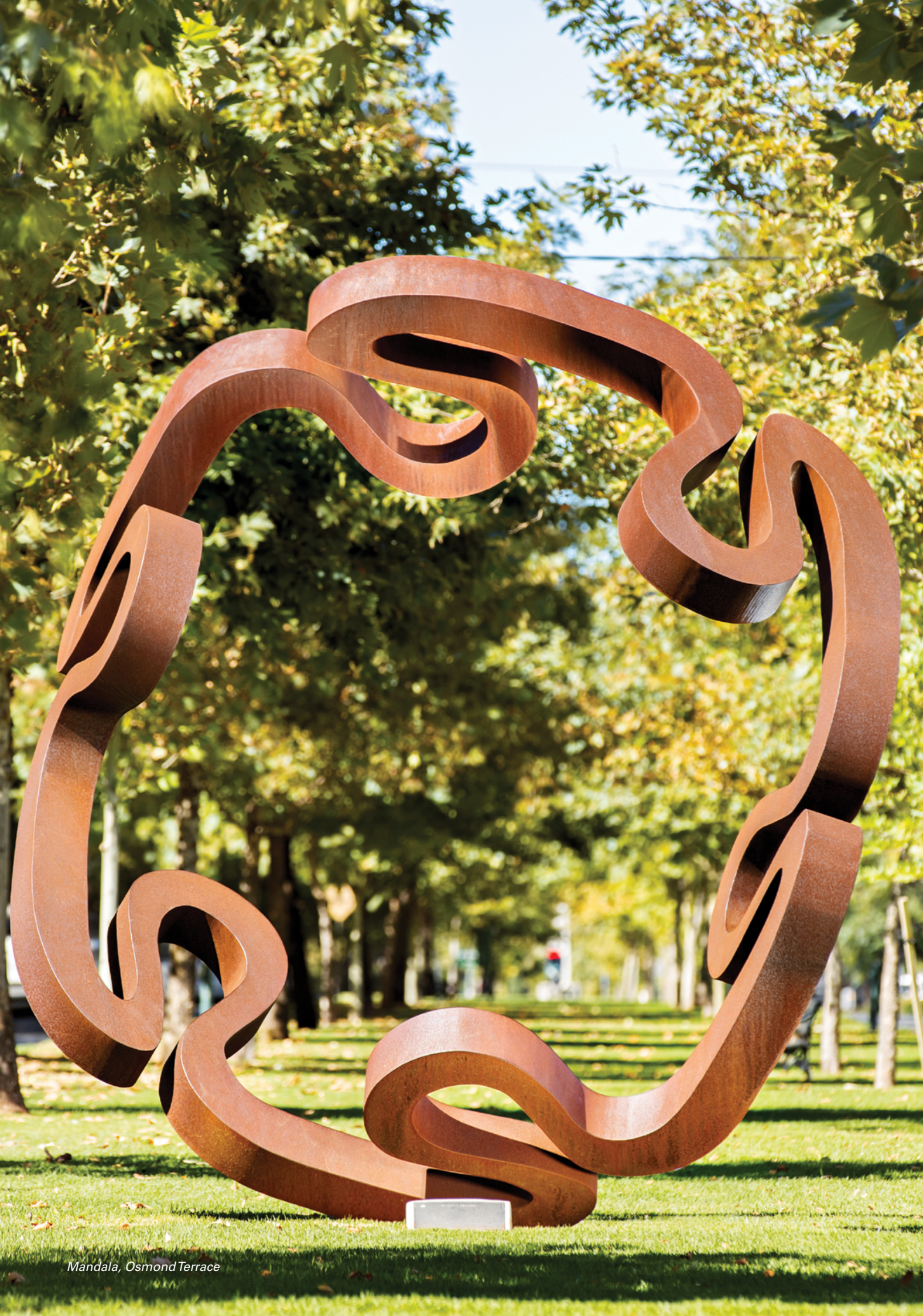
Mandala, Osmond Terrace